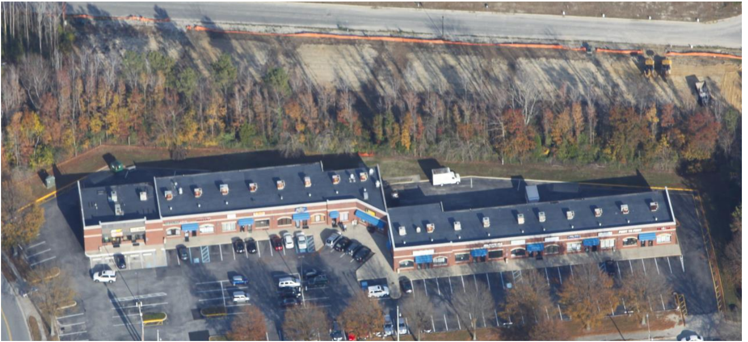
Diamond Springs Shoppes, Virginia Beach, VA