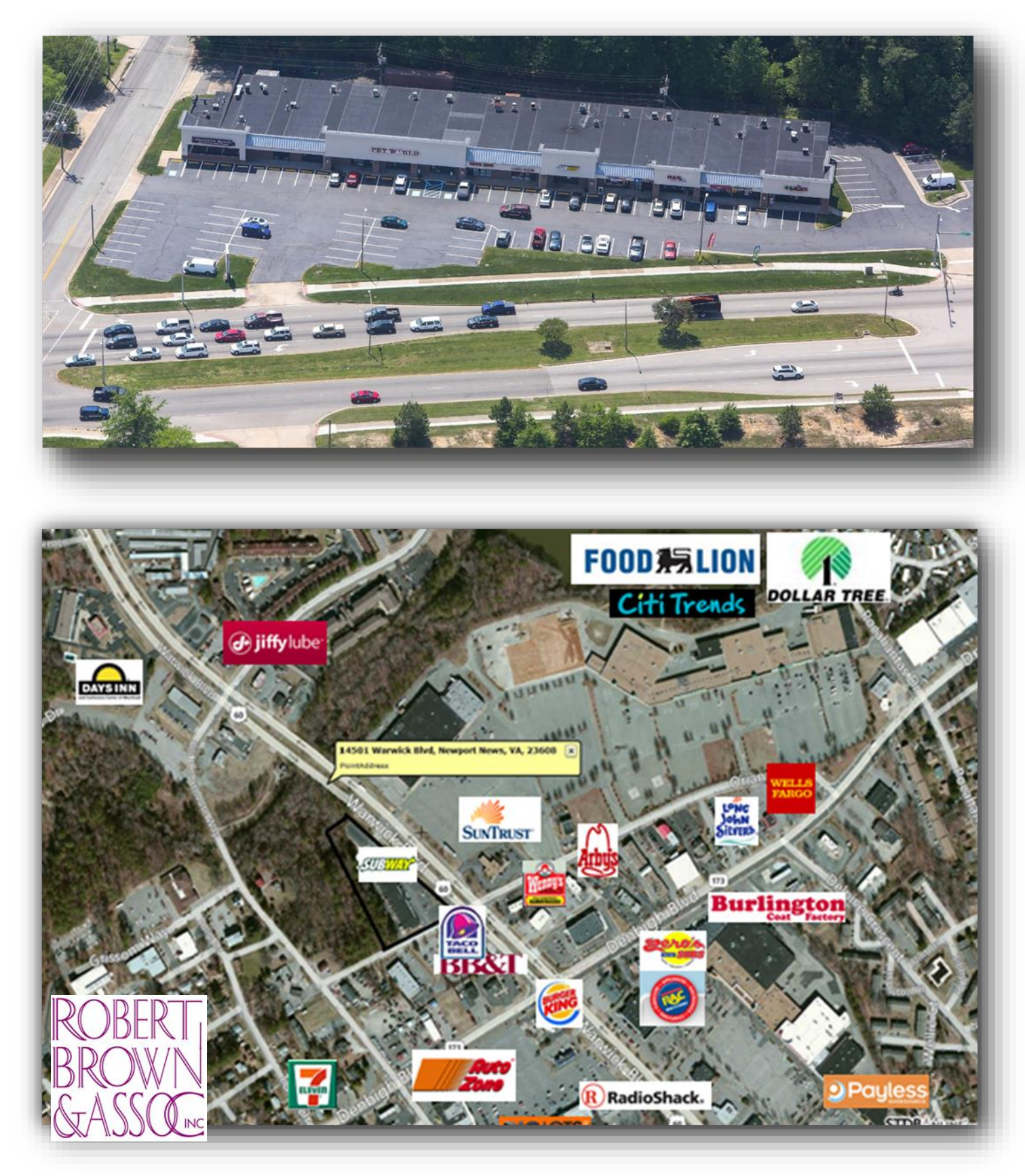
The information supplied herein is from sources deemed reliable. It is provided without any representation, warranty or guarantee, expressed or implied, as to its accuracy. Prospective Tenants should conduct an independent investigation and verification of all matters deemed to be material.